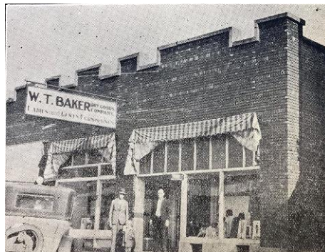
W. T. Baker Dry Goods building on 2 nd Ave N, in 1930 became the second and final location of Chicago Sales