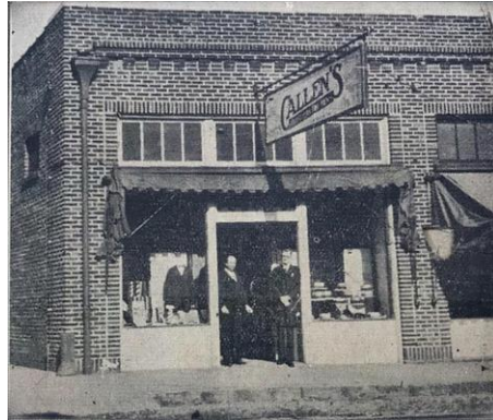
Callen's was immediately behind Upchurch's Drug Store . Building later became the 7 th St. facing part of Elmore's 5 & 10 .