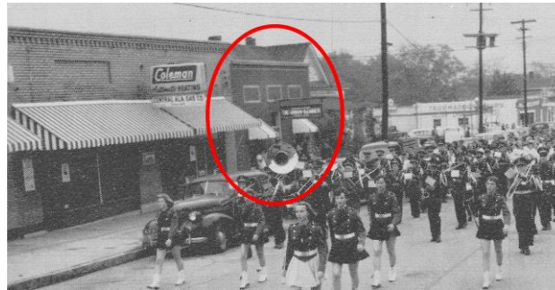
Union-Banner 6 th St. office south of 2 nd Ave N. from 1956 CCHS Silver Shield annual.

The Clanton Press ceased publication in April 1919 and the equipment was bought by The Union-Banner in 1922.