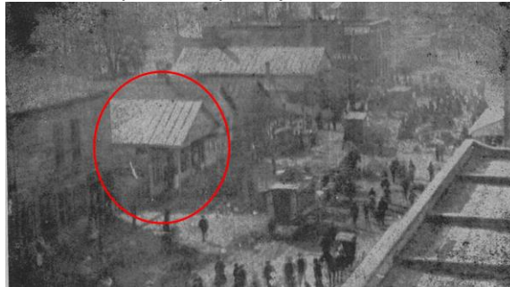
Union-Banner office: Oct 5, 1901 on 2 nd Ave N.

The original Banner office was on the south side of 2 nd Avenue North about where Chicago Sales would later be located; it was the next building over from the old wooden courthouse that was moved. About March 1902 it moved into a new building, the one shown on the 1917 Sanborn Fire Insurance map, across from the Courthouse on 6 th Street. In November of 1921 The Union-Banner bought a lot in "block 11" and built a brick building for their office and printing. This location was on the east side of 6 th Street just south of 2 nd Avenue North by the alley and jail.