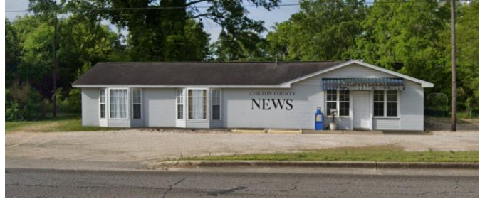
Chilton Co. News offices: January 7, 1937, new building. Middle same bldg. in 2022. Right: current office, 1205 7 th St. S.