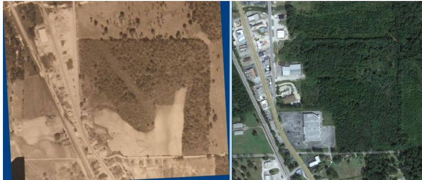
Visible tract owned by Blassingame in ca 1940 and modern satellite views. Exact location in this tract of the HotWell is unknown, but from the above, like the northwest corner between 6 th and 7 th Streets.