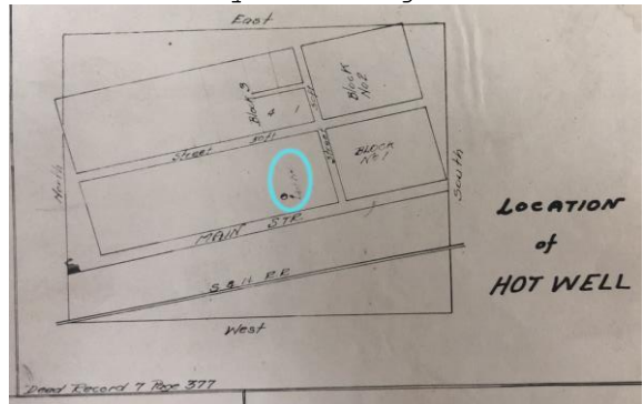
Map from Chilton Map Book #1, ca1897, showing the "Location of Hot Well."

Blassingame owned the 40 acre tract in south Clanton that is currently where the original Clanton Walmart, the current Clanton Post Office, and the US 31 and 6th Street intersection are located ("Blassingame's point"). The Chilton County Map book #1 has a small insert that shows the "Location of Hot Well." The railroad and "Main Street" are shown but the other streets are not labelled. From the property location above and the map segment it is pretty clear the Hot Well was likely between 6 th and 7 th Streets near the point where they come together.