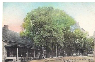
Left: Looking north down 8 th St. from 2 nd Ave N, Davis Boarding House on left, grocery on right. Right: 1917 Sanborn Map

NOTE: On your address label, the two-digits after your name is the year through which you are paid. "L" = lifetime