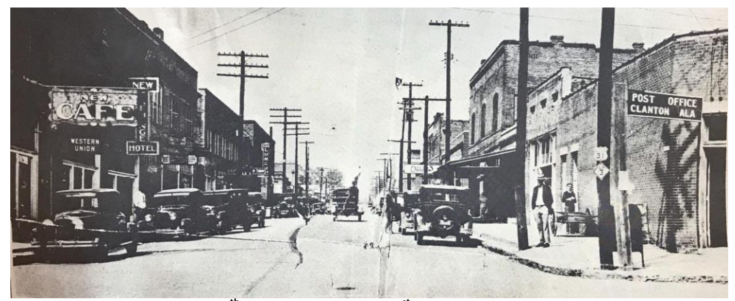
April 1929, Birmingham News, Clanton, 7<sup>th</sup> St looking north from 1<sup>st</sup> Ave., post-fire Hayes building 1-story Post Office, right.